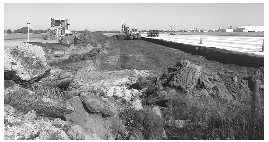
RUNWAY 30L CONSTRUCTION