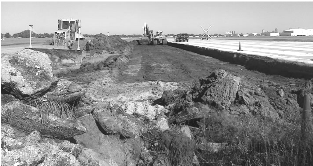
RUNWAY 30L CONSTRUCTION